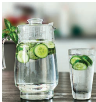
Infused in water