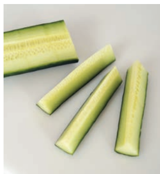
Cut in half and quarters.